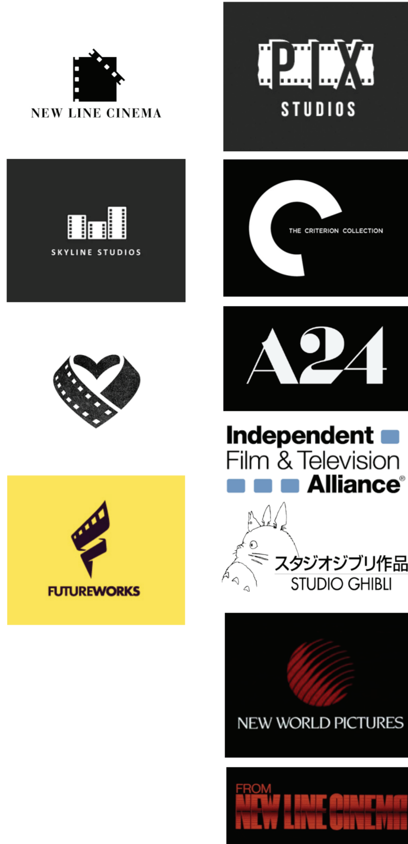
VHS branding, old tape media machines?

You must create a logo using the information given in this brief. The logo will be embroidered on uniforms. Take into account the company's values and preferences, and make sure it will work for the planned use-cases.